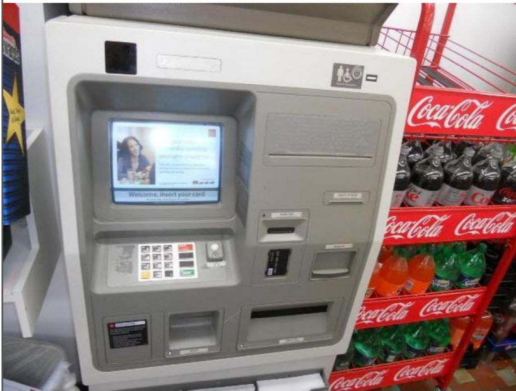
5838V - 07/28/2011 - CLOSE UP GAS STATION 296 E 7TH ST,ST PAUL,MN 55101